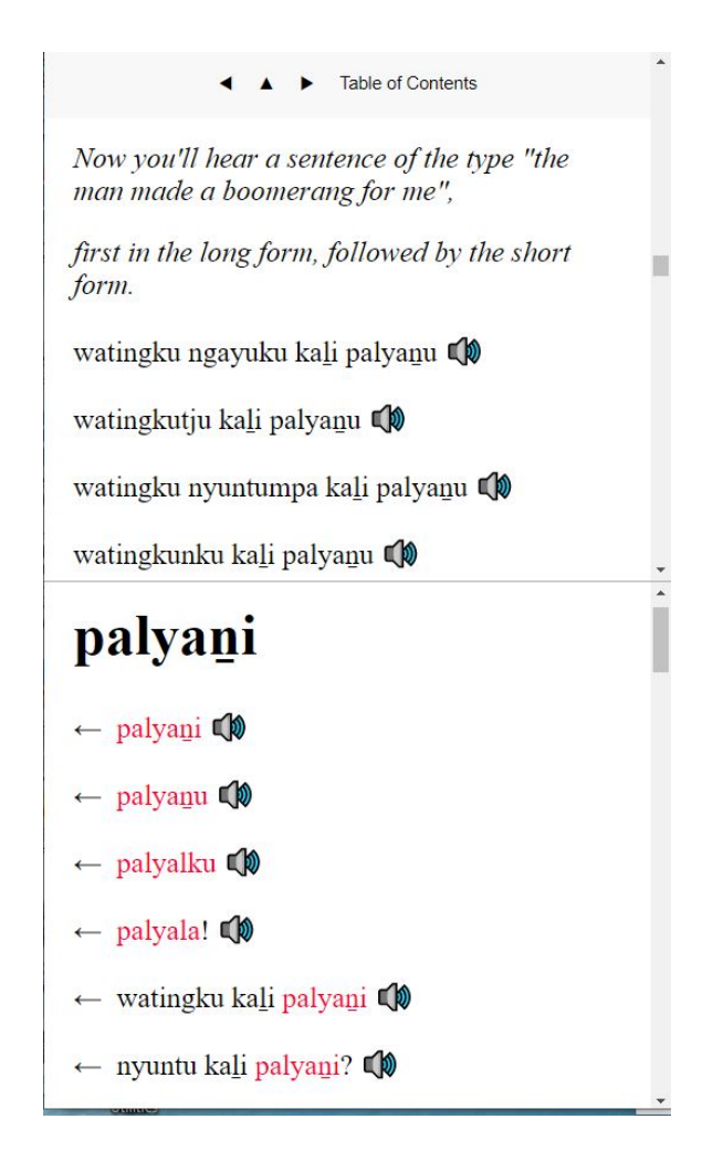
Figure 3: Screenshot showing the short section of the Pitjantjatjara course used in Figure 2, as it appears in the final LARA document. Clicking on an audio control plays the preceding segment. Hovering over a morpheme highlights it and shows a popup gloss: thus, for example, in the word watingkunku it is possible to hover over any of the three component morphemes wati ("man"), -ngku (ergative case suffix) and -nku ("for you"). Clicking on a morpheme plays audio and shows a concordance in the other pane. Here, the user has clicked on palyanu ("made"). The document is freely available online, a link is given in §4.