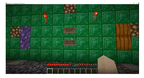
Figure 8: Clues for the first escape room: 'I wonder what these pressure plates do?', 'I think we need to stand on both at the same time'.