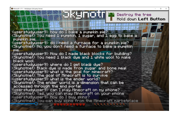
Figure 6: Player asking NPC questions about Minecraft

Table 3: Player and NPC interaction for mining 1 dirt, mining 4 oak logs and crafting an oak plank.