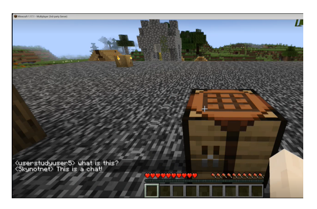
Figure 10: Player pointing at an object and asking NPC 'what is this?'

During the user study, we found multiple instances where participants were expecting the NPC to be able to see the things in the games, just like a player does. Figure 10 shows one such instance where player pointed at a crafting table and asked the NPC "what is this". The NPC responded "this is a chat" since it had only textual context. Figure 11 shows another instance where participant pointed at a location and told the NPC "place the crafting table here". Lastly, during the escape room interaction, one participant looked at the pressure plate and told the NPC "stand where I am looking". These cases strongly suggest the need for the NPC to have visual capabilities.