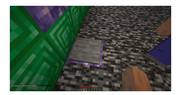
Figure 12: Player asking the NPC to stand where they are looking.