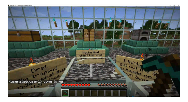
Figure 9: Clues for the second escape room: 'Maybe that chest has what I need to get out', 'I think I can get out if I get my hands on an Iron Sword'

suggests that users would like the NPC to have a persona and a history of its previous game experience.