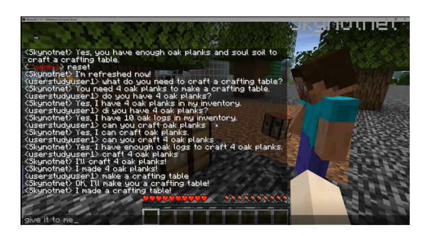
Figure 5: Player instructing the NPC to craft items

Participants asked the NPC to craft an oak plank, a crafting table and a chest. The third example in table 3 shows an interaction involving crafting an oak plank. When the player asked if the NPC can craft an oak plank, the NPC generated a chain of functions where it first obtained the ingredients of an oak plank and then created a query for the question answering prompt where it checked whether it had those ingredients in its inventory. Since it did not have them, it threw an error message indicating that it couldn't make the plank. The player followed up by asking what is needed to make the plank and the NPC responded with the recipe for making oak plank. The player then asked the NPC to get the oak log and make the plank. The NPC