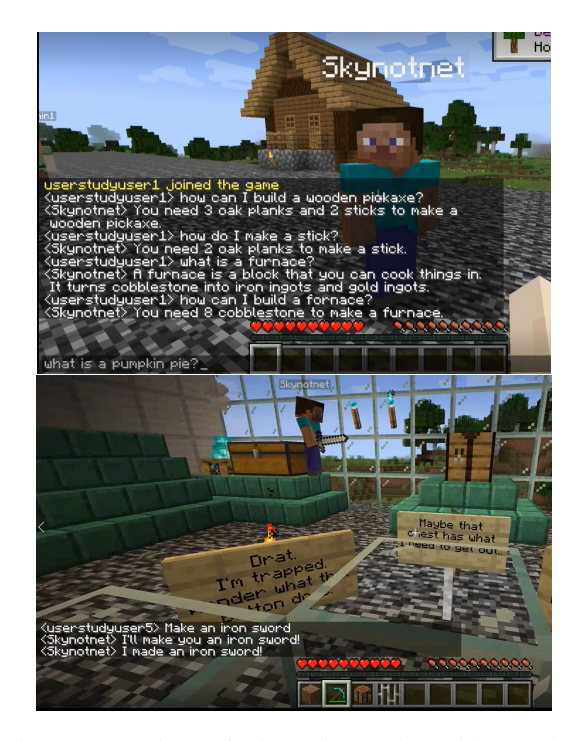
Figure 1: A Minecraft player interacting with a Codexpowered NPC in in two scenarios: question answering (top) and task completion (bottom).

The recent advent of large pre-trained language models such as GPT-2 (Radford et al., 2019) and GPT-3 (Brown et al., 2020) has fostered spectacular advances in text-generation. In this work, we focus on the potential application of these large language models in video games. In games, Non-Player Characters (NPCs) enhance the player experience by providing interaction, often involving conversation. Currently players' conversations with NPCs are highly scripted: in a typical scenario players must select from a set of preset responses that they can give to the NPC. Moreover, this interaction is limited to natural language responses, and does not directly involve dynamic game state change as