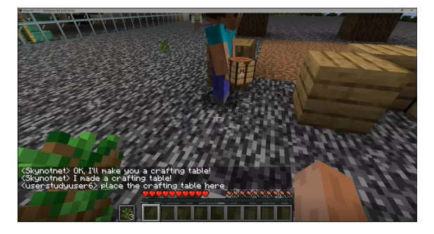
Figure 11: Player pointing at a location and asking the NPC to place a block there.