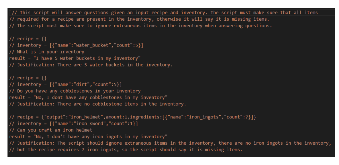
Figure 3: Sample of the second prompt that gets called during question answering.

Autoregressive prompting: Also known as Retrieval-Augmented Generation (RAG) (Lewis et al., 2020). For prompts that require knowledge of game state, e.g., inventory/crafting queries, we create a call through Codex that first gathers the requisite information and then self-generates a call to itself with the needed information. The last command shown in Figure 2 responds to crafting questions by first obtaining an ingredient list, then calls createQueryPrompt to generate a secondary completion on a sub-prompt (Figure 3) using the data.