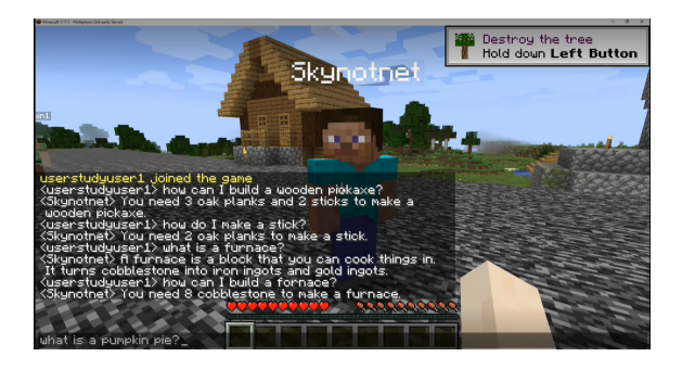
Figure 4: Participant interacting with the NPC to get the crafting recipes of different resources

Table 4 shows sample player inputs and generated code. We find that participants used different phrases (see table 1) to frame their questions and the NPC was usually able to correctly map these to the right function call. It was able handle minor variation in the resource name ('wood pickaxe' instead of 'wooden pickaxe'), misspellings ('fornace'), contextual phrasing ('what goes into a pumpkin pie' since its a food item), and nonquestion phrasing ('recipe for clock'). Some participants held extensive conversations with the NPC