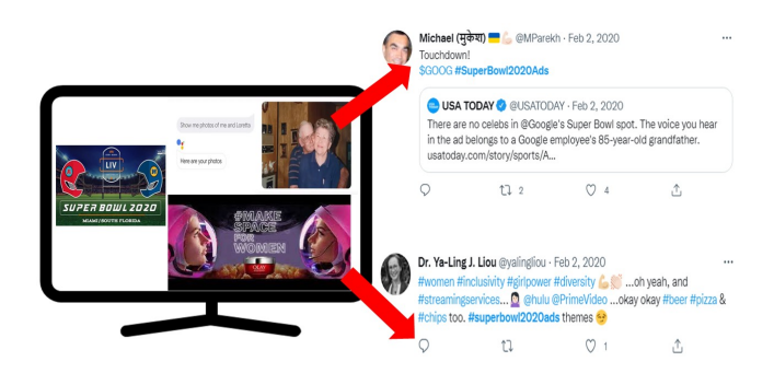
Figure 1: Mapping the the tweets referring to advertisements telecast during the Superbowl event. For e.g., the tweet mentioning #diversity and #inclusivity is mapped to the advertisement by Olay featuring the hashtag #makespaceforwomen .

The joint consumption of television programming and social media participation has become increasingly popular, leading to the rise of Social TV ecosystems (Proulx and Shepatin, 2012; Benton and Hill, 2012; Cesar and Geerts, 2011). Twitter has become an integral outlet for TV viewers, with a whopping 85% of users tweeting while watching television programming (Midha, 2014). Marketers, television networks, and social media platforms have explored this rising potential of Social TV ecosystems. For example, Twitter and content providers on television networks collaborated recently (Crook, 2016) to create social TV experiences, and companies such as Nielson (Talkwalker, 2020) are investing in technologies to quantify and analyze social TV audiences.