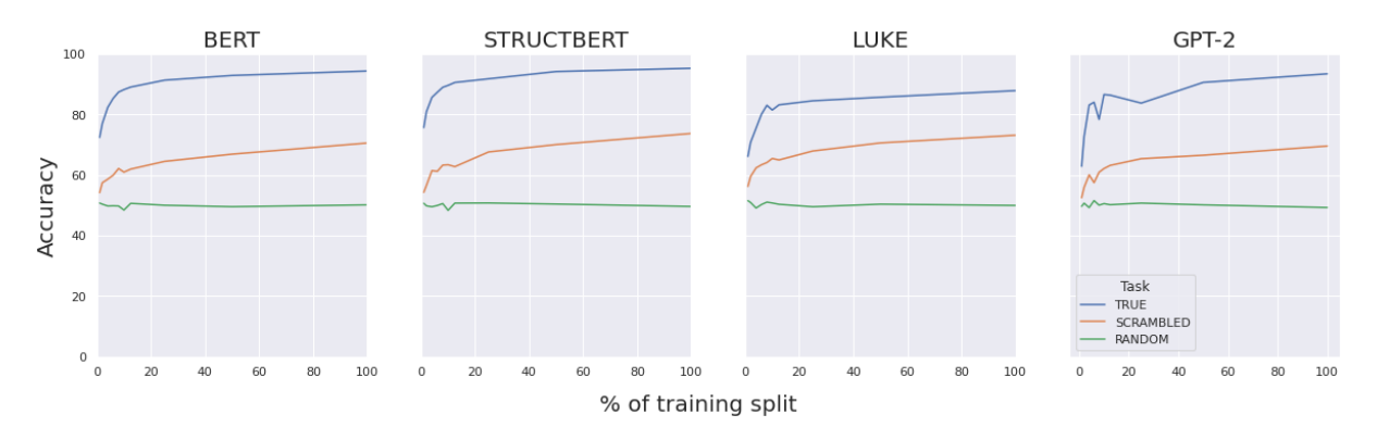
Figure 1: Accuracies of the original (true) vs. baseline (scrambled, random) probes for different training splits.

Figure 1, the Scrambled baseline achieves the highest accuracy (around 60%) across all LMs and training splits. The Random baseline achieves chancelevel accuracy across LMs and training splits, confirming that the complexity of our probing classifier is appropriate for this task.<sup>7</sup> We therefore use Scrambled to compute BPP scores, as it yields the strictest (or most selective ; Hewitt and Liang, 2019a) baseline setup.