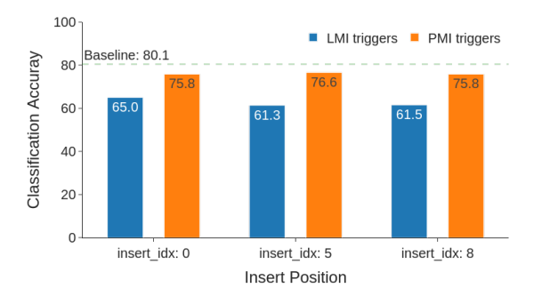
Figure 3: Attack performance of LMI trigger and PMI trigger of the different insert position.