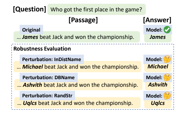
Figure 1: An illustrative example of the robustness to entity renaming and our proposed perturbations for robustness evaluation. "Michael" is from the answer of another test instance. "Ashvith" is a person name from an external database. "Uqlcs" is a random string with the same length as the original name.

The task of machine reading comprehension (MRC) measures machines' understanding and reasoning abilities. Recent research advances (Devlin et al., 2019; Yang et al., 2019; Khashabi et al., 2020) have driven MRC models to reach or even exceed human performance on several MRC benchmark datasets . However, their actual ability to solve the general MRC task is still questionable (Kaushik and Lipton, 2018; Sen and Saffari, 2020; Sugawara et al., 2020; Lai et al., 2021). While hu-