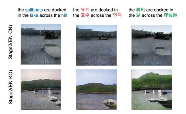
Figure 4: Image generation results of the LaSC-GAN. The images were generated with sentences in which the nouns in the English description were replaced with Chinese and Korean nouns, respectively.

semantically consistent images if the semantics are the same in different languages. As shown in Table 2, it can be confirmed that the distance has gotten closer after stage 2. In addition, images generated from texts in different languages with the same meaning have similar images as shown in Figure 3. And Figure 4 shows the model can extract semantic commons between languages.