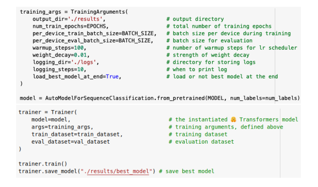
Figure 3: Fine-tuning procedure including the declaration of dataset and parameters, training procedure and saving of the model.

Figure 2: Code snippet showcasing the feature extraction and tweet similarity interface. Note that using our Twitter-specific XLM-R model leads to emoji playing a crucial role in the semantics of the tweet.