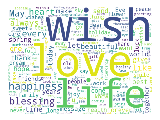
Figure 2: The word cloud visualization of EBleT.

and objects, we plot the word cloud of EBleT as shown in Figure 2. We find out that some words (e.g., "wish", "love", and "happiness") appear frequently. This phenomenon not only meets our common sense, i.e., blessing texts usually express wishes for each other, but also provides a class of words that need to be focused on for the development of future blessing generation models.