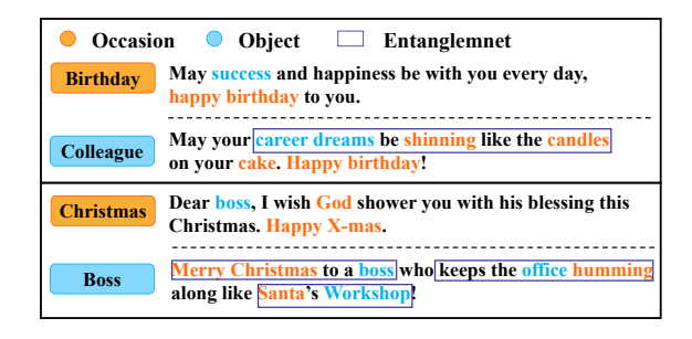
Figure 1: Two groups of blessing examples. Each group contains blessing messages without (top) and with (bottom) the attribute entanglement. Representative elements of occasion/object attributes are marked.

Controllable Text Generation (CTG) aims to automatically generate the text under the restrictions of given conditions (Prabhumoye et al., 2020; Dong et al., 2021; Sun et al., 2022). As the mainstream, controlling multiple attributes enriches the information contained by generation and matches the demand of application scenarios, such as generating Chinese poetry (Yi et al., 2020), restaurant reviews (Chen et al., 2021), and product descriptions (Xu et al., 2019).