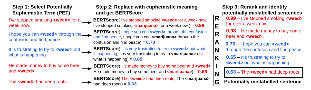
Figure 1: Example of our data cleaning pipeline to automatically identify potentially mislabelled sentences. Red indicates positively classified sentences and blue indicates negatively classified sentences.

words, we augment our corpus with a sentence c_j only if it is sufficiently similar to, or sufficiently different from, all sentences containing the PET in S. We set n=20 as the maximum number of sentences extracted from C for a PET p, and obtain a corpus of around 4700 additional examples.