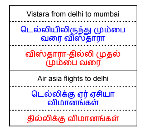
Figure 2: Translation results from Google Translate API (in blue) and IndicTrans (in red).

BC. Tamil has the oldest ancient non-Sanskritic Indian literature of any Indian language. Tamil uses agglutinative grammar, which uses suffixes to indicate noun class, number, case, verb tense, and other grammatical categories. Tamil's standard metalinguistic terminology and scholarly vocabulary is itself Tamil, as opposed to the Sanskrit that is standard for most Aryan languages. Tamil has many forms, in addition to dialects: a classical literary style based on the ancient language (cankattami), a modern literary and formal style (centami), and a current colloquial form (kotuntami) (Sakuntharaj and Mahesan, 2021, 2017, 2016; Thavareesan and Mahesan, 2019, 2020a, b, 2021). These styles blend into one another, creating a stylistic continuity. It is conceivable, for example, to write centami using cankattami vocabulary, or to utilize forms connected with one of the other varieties while speaking kotuntami (Subalalitha, 2019; Srinivasan and Subalalitha, 2019; Narasimhan et al., 2018). Tamil words are made up of a lexical root and one or