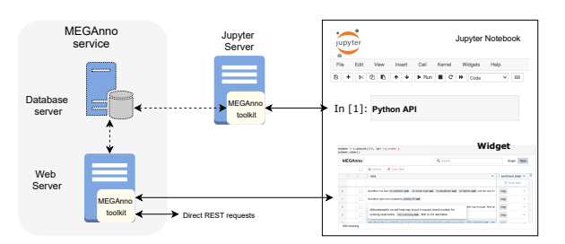
Figure 2: The MEGAnno framework provides exploratory annotation services through a toolkit (installable as Python libraries) providing programmatic interfaces, a web server providing language-agnostic REST APIs, and an internal database to store data, annotation, and related artifacts. Solid lines show programmatic interactions through Python APIs calls and REST calls delegated by our notebook widget or directly issued by authenticated applications. Dotted lines show internal interfaces where MEGAnno toolkit handles communication with the database and are hidden from the users.

MEGAnno provides service through 1) an internal database that stores the data, annotations, and various artifacts produced in the annotation process, 2) a MEGAnno toolkit that provides python API for programmatic and visual data exploration and labeling, and 3) a web server that provides language-agnostic REST APIs (Fig 2). After installing the toolkit on a Jupyter server, users will have access to our Python APIs and React-based widget to manage their project, explore and annotate their data from any connected notebook.