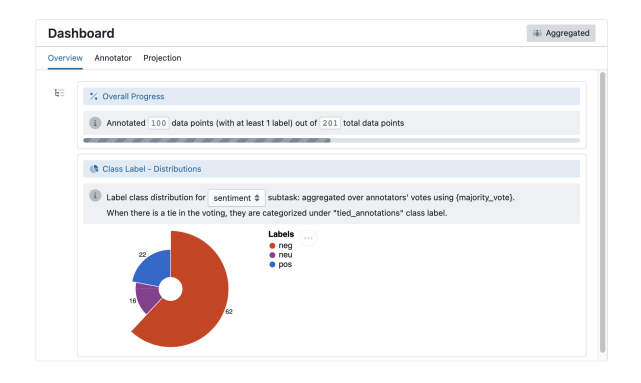
Figure 6: Dashboard widget to monitor the progress and statistics of the project and aid decision-making.

the project's status to make decisions about the next steps, like collecting more data points with certain characteristics or adding a new class to the task definition. To aid such analysis, the dashboard widget packs common statistics and analytical visualizations based on a survey of our pilot users. The "overview" panel shows statistics about overall progress and per-label class distribution. If multiple annotators are involved, the distribution reflects the majority vote over annotators ^2 . The remaining "annotator" and "projection" panels are hidden due to space limitations. To help identify problematic annotators, the annotator pannel shows statistics like overall individual contribution and disagreement scores with others. The projection panel provides customizable visualization to project data points to a two-dimensional visual space. By default, we show the t-SNE (Van der Maaten and Hinton, 2008) projection of sentence bert (Reimers and Gurevych, 2019) embeddings.