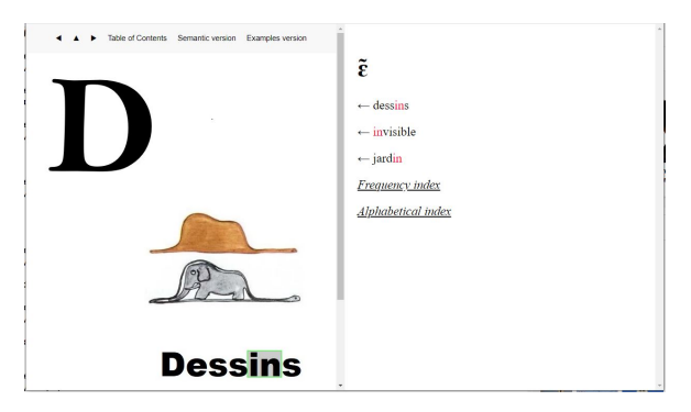
Figure 3: "Phonetic" version of an example page from a "Little Prince" themed LARA alphabet book for French; each page is in three versions, "phonetic", "semantic" and "example". Hovering over the word Dessins ("Drawings") outlines phonetically meaningful letter groups; clicking plays audio for the phonetic content selected and shows a phonetic concordance. The student has selected the letter group in, showing on the right other words containing the nasalised vowel |\tilde{\epsilon}| that this letter group usually represents in French. In the "semantic" version, hovering over the picture on the left outlines it and clicking on it plays audio for the word. The "example" version shows an annotated example sentence. The document can be found here.

In order to show how the different functionalities introduced in this section can be usefully combined, we present an example in a familiar language, a multimodal French alphabet book based on Le petit prince where each page occurs in three different parallel-linked versions. Figure 3 illustrates. Note that in the second, "phonetic", version, the "picture-book" and "phonetic" functionalities have been combined.