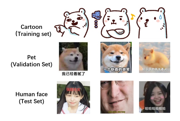
Figure 4: An example shows the division of Hard Task-3 and the significant variation of styles between the stickers series.

ers is huge, and new stickers appear every day. In order to investigate whether the model can adapt to the newcomer stickers and the artistic style among different sticker series, we divide the dataset into four different ways: Easy Task, Hard Task-1, Hard Task-2, and Hard Task-3. The division is shown in Table 2. In particular, Easy Task randomly divides the whole dataset in the ratio of 6:2:2. The training set and validation set stickers may appear in the test set. Hard Task-1 randomly divides the stickers so that stickers from the test set will not appear in the training and validation sets. Hard Task-2 randomly divides the sticker series so that the sticker series from the test set will not appear in the training and validation sets. Hard Task-3 partitions the stickers into three categories: human face-based, pet-based, and cartoon character-based. As shown in Figure 4, there is a considerable difference in style between them. The Hard Task-1 measures whether the model can adapt to the new sticker. The Hard Task-2 measures whether the model can adapt to the new sticker series. The Hard Task-3 measures whether the model can adapt to unseen sticker series, which varies greatly from the previous one.