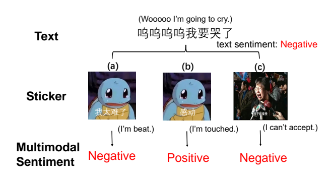
Figure 2: An example for showing how the sticker influences sentiment in multimodal sentiment analysis. A sentence accompanied by different stickers may express reversed sentiments. An image accompanied by different sticker texts may also express reversed sentiments. The contents in brackets are translations from Chinese.

We propose a Sticker-Aware Multimodal Sentiment Analysis Model (SAMSAM) to address the above three challenges. To address the first and second challenges, SAMSAM introduces the sticker text and sticker series tag, which can be seen as a further complement to sticker sentiment to model the sticker wholly and accurately. To address the third challenge, SAMSAM adopts the flexible masked attention mechanism to allow post texts and stickers to interact fully but selectively. The masked attention mechanism can help the model extract the most helpful information for the current sentiment judgment. We conduct experiments on the proposed CSMSA dataset. The experimental results show that our model performs best in the challenging CSMSA task. The ablation study indicates that the encoding of sticker texts and sticker series help in understanding multimodal sentiment,