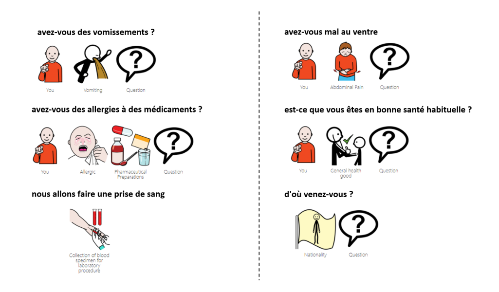
Figure 3: Examples extracted from the test data. The system translated the human transcriptions (sentences in bold) to UMLS gloss (terms below each picture). The result was then mapped to Arasaac pictographs.