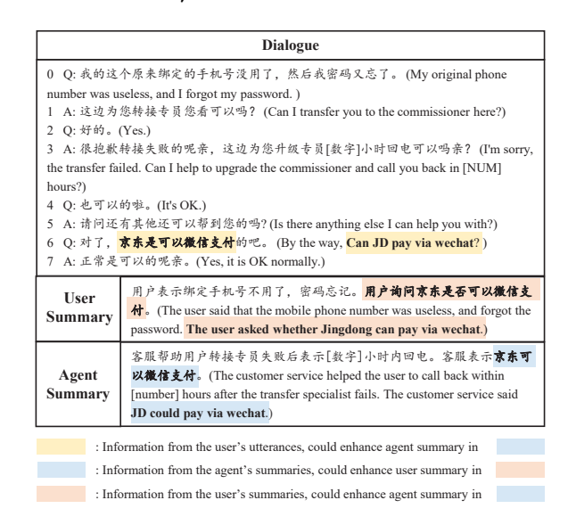
Figure 1: An illustration of the role-oriented dialogue summarization. The task will generate User Summary and Agent Summary for the user (Q) and the agent (A), respectively. The information from other roles could help enhance the summary quality.

Dialogue summarization aims at compressing the main content of a long conversation into a short text. With the development of online conversation tools, the amount and length of conversation are growing up rapidly. Since a dialogue often contains complicated structure and ellipsis, it is time-consuming to read the whole dialogue. Dialogue summarization thus becomes valuable since it could extract the key point of a conversation and greatly reduce the time cost. This technique is widely used in customer service (Liu et al., 2019), meeting (McCowan et al., 2005), online chatting (Gliwa et al., 2019), etc.