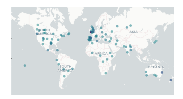
Figure 3: Ablating all toponyms at inference time spreads out the probabilities (points lighted up all over the map) but can still correctly predict Arlington ( England ) purely from context.

Ablations Table 6 shows ablation of salient features at inference time, removing either the target toponym or all toponyms. While masking the target toponym does not change results much except for GeoVirus, masking all other toponyms degrades performance considerably. Nevertheless, it may still be possible with just the context words, which include other named entities, characteristics of the place, and location-focused words in few cases. For example, Arlington (England) can be geolocated after all toponyms are masked (Fig. 3), though the distribution is more spread out in this case.