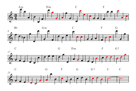
Figure 5: Adjusted output, with chords. Notes which have been modified from the output in Figure 4 are color-coded red.

Figure 5 shows the final version of the output in which some notes (shown in red) have been altered or added in order to create a cadential con-