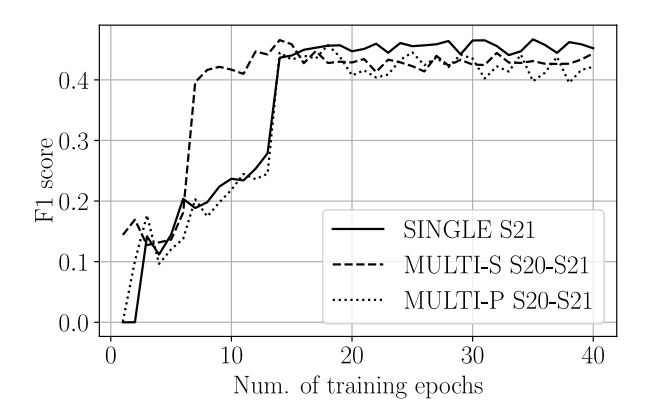
Figure 2: F1 scores during training for single task approach and multi-task learning using S20 data.

itated using external data in multi-task learning framework. The results show that the auxiliary tasks indeed influence the results, both in terms of accelerating the learning process and changing the set of recognised techniques. Nevertheless, these modifications do not offer clear advantages over the basic BERT-based solution.