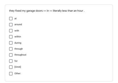
Figure 1: An example instance for the substitute selection task.

Task 1: Preposition Substitution This design consists of two crowdsourced tasks and requires an unlabeled corpus \mathcal{U} . First, in the substitute generation task , we identify an unlabeled instance \langle s,t \rangle \in \mathcal{U} , where s is a sentence and t \in s is the target preposition to be disambiguated. A crowdworker provides a substitute t' for t which approximately