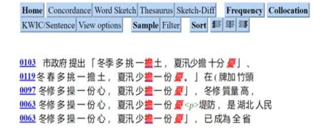
Figure 6: Separatable word of danyou in gigaword2cna

Similarly, Sinica Corpus also indicates that danxin can be used as a separatable word.