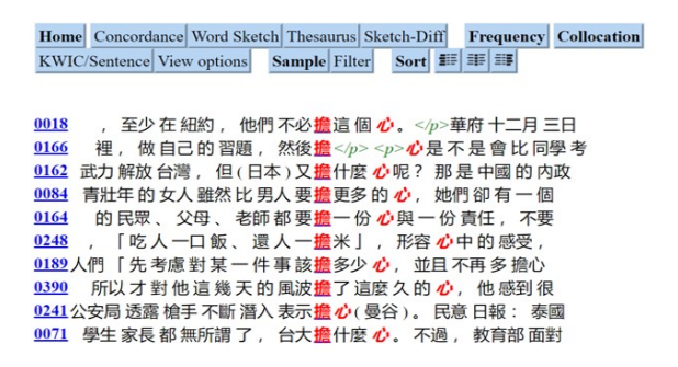
Figure 5: Separatable word of danxin in gigaword2cna