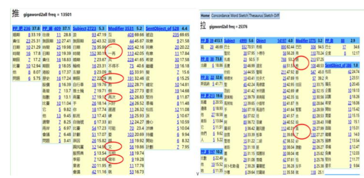
Fig. 3 collocations of "tui1" and "la1" using the "Word Sketch" tool