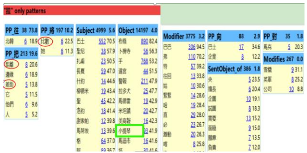
Fig. 7 only patters of "la1"