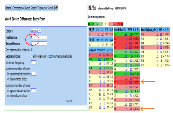
Fig. 4 Sketch-Diff tool and the results of Sketch-Diff of "tui1" and "la1"

We need more evidence from the corpora to verify the assumption. The results are shown in Fig. 4