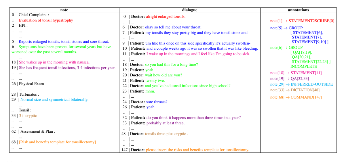
Table 2: Example annotations (right) for corresponding clinical note (left) and dialogue (middle). The same colors indicate matched associations.

the dialogue snippet), it is important to consider several differences in textual mediums: