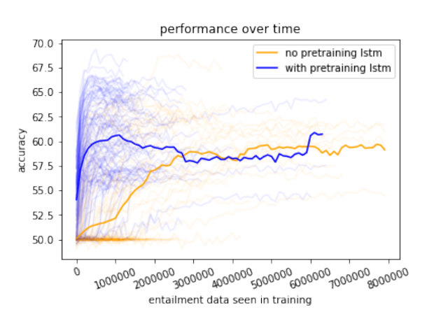
Figure 1: Average accuracy of 100 different hyperparameter settings of LSTMs on the entailment validation dataset over time.

last step of the sequence model to determine model predictions on the entailment task. We compare the performance at the entailment task of pretrained sequence models to those initialized from scratch.