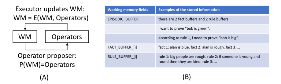
Figure 3: (A) A working cycle for the proposed neural GPS. The goal in GPS is extended to a working memory buffer (WM), and multiple operators might be generated in a cycle. (B) The composition of the working memory and possible values stored in each field.