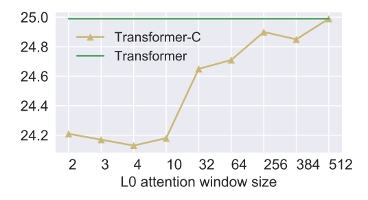
Figure 3: Transformer-C perplexity decreases with small L0 attention windows.

Training details Our NPLM is trained with dropout probability p=0.2, while the other models use p=0.1 on all datasets except for WIKITEXT-2, for which they use p=0.3. For all models, we use the Adam optimizer with \beta_1=0.9 and \beta_2=0.999 , and training is conducted on 1080Ti GPUs. During evaluation, we follow the