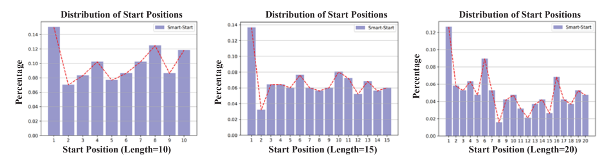
Figure 4: The distribution of different start positions of our approach. We counted the location of the start tag [m] in the intermediate translation Z. The k^{th} position represents the sentence Z_k = (y_{n-k+1}, \ldots, y_n, [m], y_1, \ldots, y_{n-k}) . Translations of our Smart-Start method with a length of 10, 15, 20 separately contain 313, 249, and 190 samples from the IWSLT14 German \rightarrow English test set.