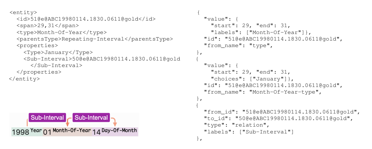
Figure 2: Abbreviated example of Anafora XML format (top left), LabelStudio JSON format (right), and Label-Studio visualization (bottom left). See fig. A1 in appendix A for the complete SUB-INTERVAL chain.