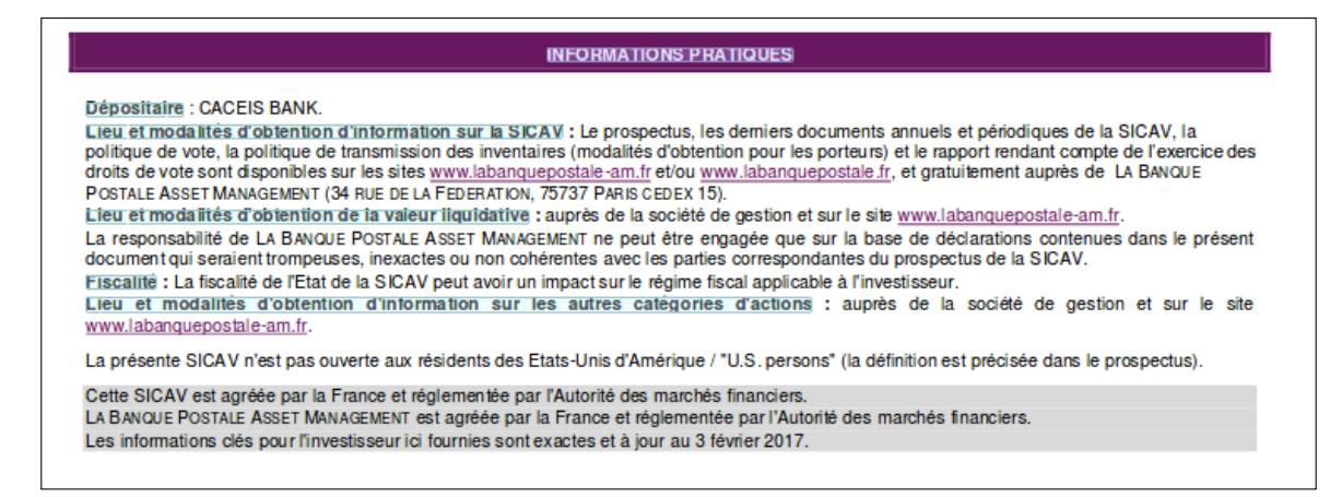
Figure 4: In this second example, the identification of titles tagged in light blue is not evident because they might be followed by plain text in the same line.

encodes the title level, we used a simple JSON file containing a list of entries, where each entry has the following information: textual content, id, level, page number. An example of a JSON extract is provided in Fig. 2. In particular, the title level is explicitly stated. Statistics about levels on the French and English datasets are presented in Table 3.