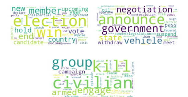
Figure 3: Topics obtained with LDA topic modeling in the 441 questions in our corpus. The topics roughly correspond to (clockwise from top left) (a) elections, (b) government actions, and (c) war and violent events.