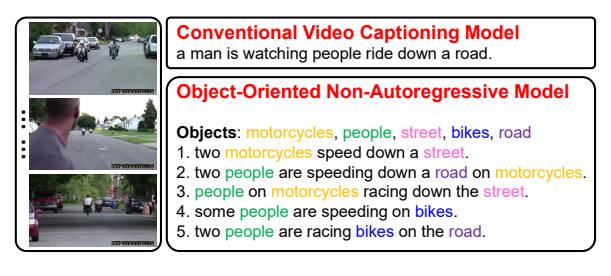
Figure 1: Examples of the captions generated by a state-of-the-art conventional video captioning model (Zheng et al., 2020) and our model. Compared to the conventional model, whose generation process is hardly controllable, our model can be guided to mention the desired objects (i.e., the colored objects) and generate diverse, object-oriented captions for a video.

The task of video captioning, which aims to generate a descriptive sentence based on the input video, has a wide range of applications. In recent years, deep neural models, particularly the models based on the encoder-decoder framework (Venugopalan et al., 2015; Pan et al., 2016b; Xu et al., 2017; Aafaq et al., 2019), have achieved great success