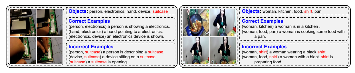
Figure 3: Examples of captions generated by our proposed O2NA. For each example, the left plot shows the input video. The upper, middle and lower parts in the right plot show the predicted objects, correct examples and error cases, respectively. The designated objects are listed in brackets. The color Red denotes unfavorable objects.

ure 3 shows that our approach is controllable and explainable. Specifically, it can generate multiple diverse captions for the same video, and can accurately follow the selected objects we care about. Besides, we find that the error mainly takes place when there are incorrectly predicted objects, e.g., "suitcase" and "shirt". O2NA mistakes the incorrect object for an appropriate one during its object sequence generation. A more powerful object predictor may be helpful in solving these problems, but it is unlikely to be completely avoided.