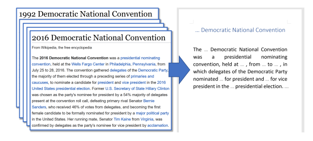
Figure 1: The right side shows a sketch for writing the report of a future democratic national convention, generated from a pile of previous reports.

Large pre-trained language models such as T5 and GPT-3 (Raffel et al., 2019; Brown et al., 2020) have enabled impressive progress on a variety of natural language generation tasks by producing fluent, coherent long texts (Rashkin et al., 2020; Zellers et al., 2019). While automated document-level generation seems tantalizingly within reach, a high branching factor presents significant challenges in tailoring generated documents to the specific requirements of users. Topic drift and "hallucination" of information are endemic to these models (Wiseman et al., 2017). These risks have ensured that end-user applications involving text generation (e.g., Smart Compose, Smart Reply, Grammarly) still require a human to remain in control of content and are restricted to individual sentences or even smaller segments of text (Chen et al., 2019;