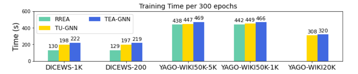
Figure 4: Training time per 300 epochs on different datasets.

becomes greater with the decreasing of the numbers |\mathcal{S}| of alignment seeds from 1000 to 200. In practical applications, alignment seeds are difficult to obtain. Since our method performs well with a small amount of pre-aligned entity pairs, it can more easily be applied in large-scale KGs compared to time-unaware EA methods.