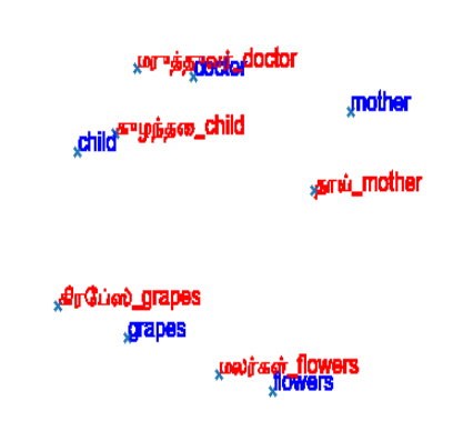
Figure 1: Visualization of Bilingual Embedding using T-SNE plot

using Apache Spark<sup>®</sup> Framework (Zaharia et al., 2016). The word pairs are filtered in two folds, cosine similarity and lemmatization (Kengatharaiyer et al., 2019), where the root word is extracted from the surface forms. In the case of cross-lingual embedding, cross-lingual entropy is used instead of the cosine similarity measure. Figure 3 shows the architecture.