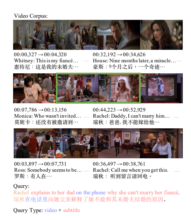
Figure 1: A MTVR example in the Video Corpus Moment Retrieval (VCMR) task. Ground truth moment is shown in green box. Colors in the query text indicate whether the words are more related to video (orchid) or subtitle (salmon) or both (orange). The query and the subtitle text are presented in both English and Chinese. The video corpus typically contains thousands of videos, for brevity, we only show 3 videos here.

The number of videos available online is growing at an unprecedented speed. Recent work (Escorcia et al., 2019; Lei et al., 2020) introduced the Video Corpus Moment Retrieval (VCMR) task: given a natural language query, a system needs to retrieve a short moment from a large video corpus. Figure 1 shows a VCMR example. Compared to the standard text-to-video retrieval task (Xu et al., 2016; Yu et al., 2018), it allows more fine-grained momentlevel retrieval, as it requires the system to not only retrieve the most relevant videos, but also localize the most relevant moments inside these videos. Various datasets (Krishna et al., 2017; Hendricks et al., 2017; Gao et al., 2017; Lei et al., 2020) have been proposed or adapted for the task. However, they are all created for a single language (English), though the application could be useful for users speaking other languages as well. Besides, it is also unclear