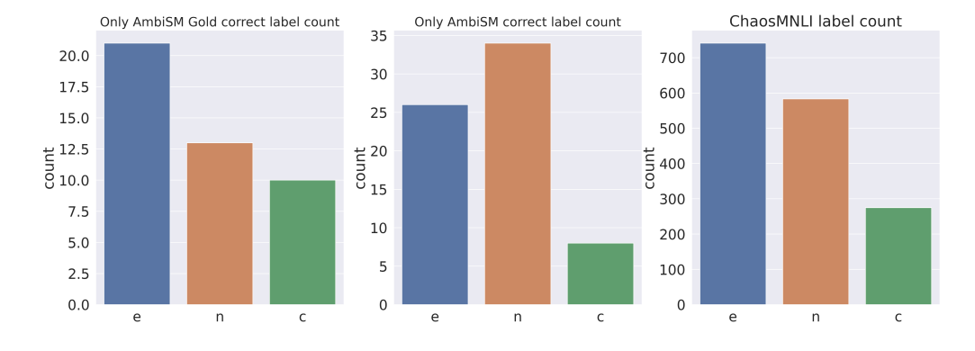
Figure 2: The count plot of the labels of the correctly predicted samples by either AmbiSM Gold or AmbiSM, AmbiSM Gold (left), AmbiSM (middle), and the labels of the whole ChaosMNLI (right). The labels e, n, and c stand for entailment, neutral, and contradiction respectively.