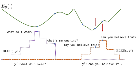
Figure 2: The EBM is trained such that its energy landscape is consistent with the BLEU score. Marginal-EBM is not conditioned on the source sentence, thus each local region is trained to have similar ranking as that BLEU score for the samples in the region.

In this paper, we describe how to train EBMs<sup>1</sup> to achieve the desired ranking. Our energy ranker consistently improves the performance of Transformerbased NMT on German-English, Romanian-English and Italian-English tasks from IWSLT'14, the French-English task from IWSLT'17, German-English task from WMT'14, and English-German task from WMT'16, as well as the low-resource Sinhala-English and Nepali-English tasks described in the FLoRes dataset (Guzmán et al., 2019).