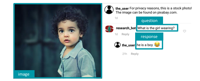
Figure 1: An example question and response pair collected from social media. Note that since the questions are generated by a bot, the question may not always be relevant to the image, as demonstrated here.

The dataset consists of questions and responses collected from an image-sharing social media platform. We utilize an automated question-generation bot in order to access public image posts, generate a question based on image features, and record data from users that replied to the question, as shown in Figure 1 (Krishna et al., 2019). Because the question-generation bot was designed to maximize information gain, it generates questions across a wide variety of categories, including objects, attributes, spatial relationships, and activities (among others). For the sake of space, we refer readers to the original paper for more information on the method of question generation and diversity of the resulting questions asked. All users that contributed to the construction of this dataset were informed that they were participating in a research study, and IRB approval was obtained for this work. For the privacy of our users, the dataset will not be released at this time. Rather than focus on the specific dataset, we wish to instead present a general method for cleaning user-generated datasets and argue its generality even to tasks such as visualquestion-answering.