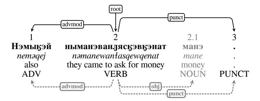
Figure 4: Dependency tree for the sentence in Figure 5. The enhanced representation is shown in grey. As for morphological features, the verb is marked with a feature Incorporated[obj]=Yes and a feature Valency=1 to indicate the intransitive nature of the verb. The incorporated noun in the enhanced representation receives the feature Incorporated=Yes.