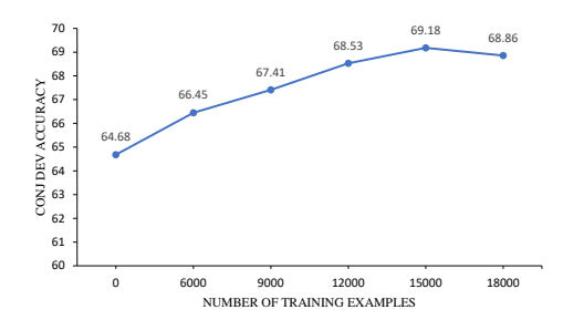
Figure 3: Effect of amount of adversarial training data.

tion seeds can lead to significantly different results on these datasets. They show that this instability largely arises from high inter-example similarity, as these datasets typically focus on a particular linguistic phenomenon by leveraging only a handful of patterns. Thus, following their suggestion, we conduct an instability analysis of CONJNLI by training RoBERTa on MNLI with 10 different seeds (1 to 10) and find that the results on CONJNLI are quite robust to such variations. The mean accuracy on CONJNLI dev is 64.48, with a total standard deviation of 0.59, independent standard deviation of 0.49 and a small inter-data covariance of 0.22. CONJNLI's stable results compared to most previous stress-tests indicate the diverse nature of conjunctive inferences captured in the dataset.