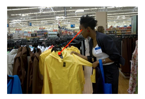
U: これのLはないのかしら V: 同じ服がたくさんあるからどれかはLじゃないかな N: 同じ服のサイズをチェックする

Although these studies and resources have been shown to be useful, there are currently two limitations. First, in image-grounded dialogue tasks,