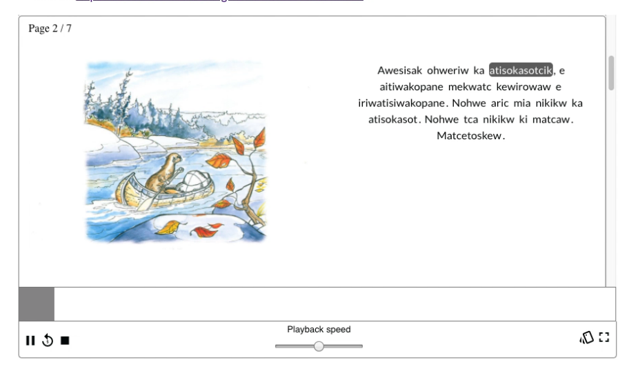
Figure 3: The ReadAlong Web Component displaying the Atikamekw story 'Nikikw'