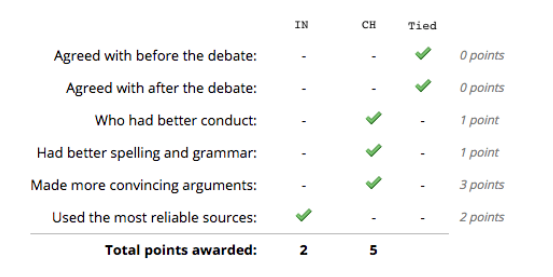
Figure 1: Example debate