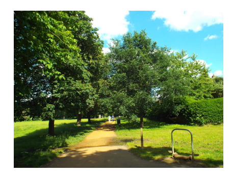
Figure 1: An example image.

One of the aspects that are missing from standard caption generation systems is the ability to produce image descriptions influenced by the geographic context, i.e. geographic objects surrounding the image location. For example, consider the photograph in Figure 1: