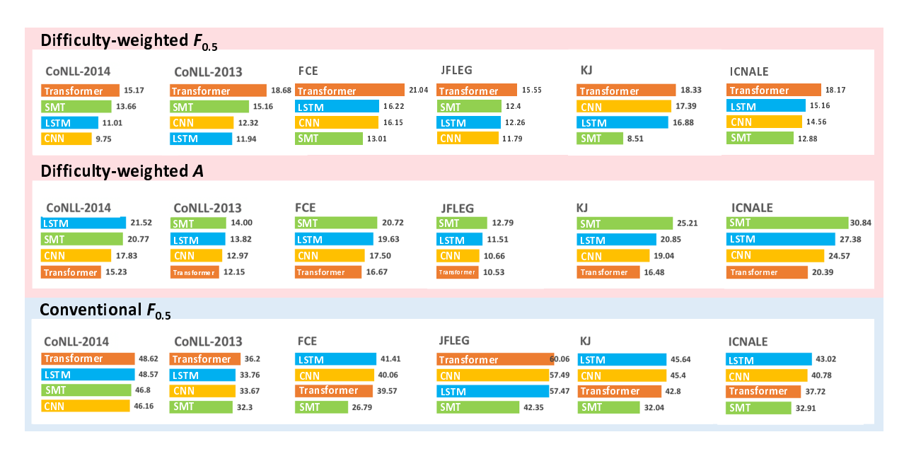
Figure 3: Evaluation in Difficulty-Weighted F_{0.5} , Difficulty-Weighted A, and Conventional F_{0.5} .

As reported in Mita et al. (2019)'s work, Fig. 3 shows that according to the conventional F_{0.5} , the system rankings greatly vary across the six corpora. In contrast, the top-ranked system (Transformer) always remains in first place in our weighted F_{0.5} . In addition, the difference in performance between Transformer and the next best systems tend to be large. It would be difficult to tell which measure is better because it depends on the purpose of evaluation. Having said that, the experimental results obtained by the weighted F_{0.5} at least show that Transformer has a different tendency in error correction compared to the others; otherwise it would not have been ranked in first place across all corpora. Subsection 5.2 will discuss this point in more detail.