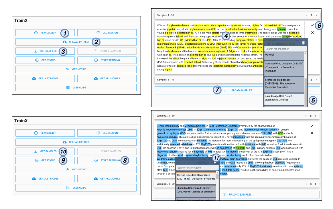
Figure 1: Usage of the TrainX system to train and evaluate the entity linker on a mixture of given GOLD and added USER labels. The screenshots show the menu, where a user requests samples or starts the training and the sample view where she can edit annotations.