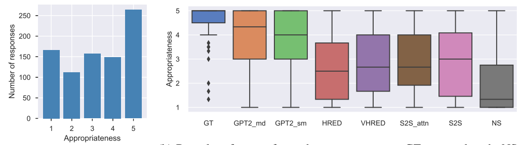
(b) Box plot of scores for each response source. GT - ground-truth, NS - (a) Overall score distribution. negative-sampling.