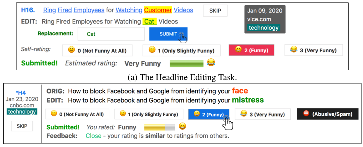
(b) The Headline Rating Task.