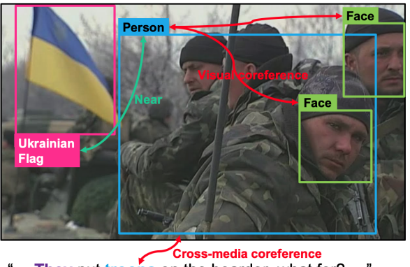
"... They put troops on the boarder, what for? ..."