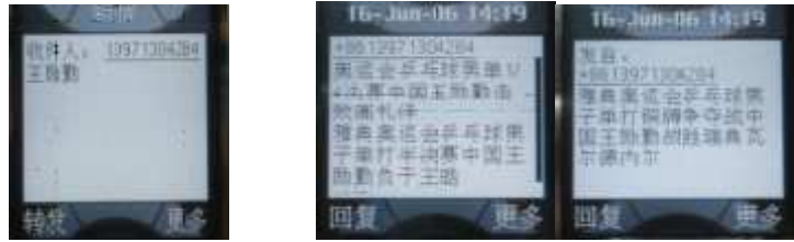
Fig. 4. Intercepted figure of mobile phone

A user was interested in the match situation about Wang Liqin, he or she just needed send the keywords “Wang Liqin” to the server number. Then the system will automatically query all the information about Wang Liqin in the source data-base generated by IE and send the result in form of SMS to the user.